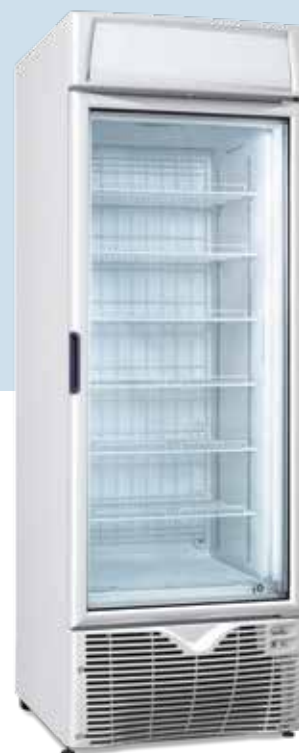
EXPO 430 NV