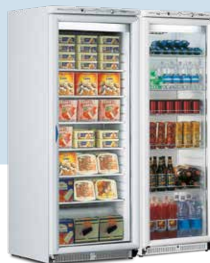
ICE PLUS N60 + BEV